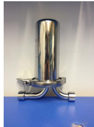
Photo of Sterile Air/Gas Filter Housing with 1/2 NPT Connections. Flow through housing is bidirectional, so you can install the filter in any orientation.