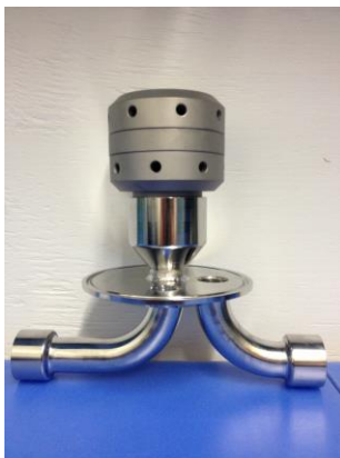
Photo of PSF-602 without housing cover