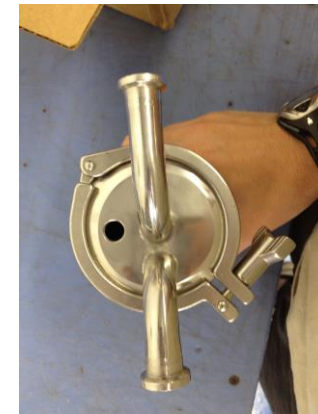
Picture of Drain Port on base of housing. A single drain valve or plug can be installed. Recommendation varies by application.