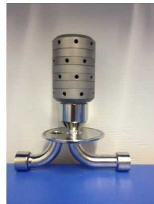
Photo of PSF-606 without housing cover