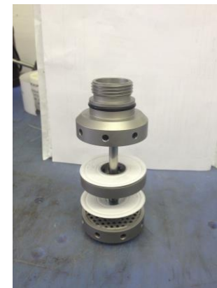
Photo of PSF-602 expanded to show PTFE media.