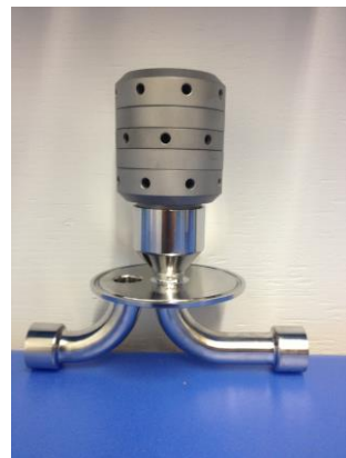
Photo of PSF-604 without housing cover